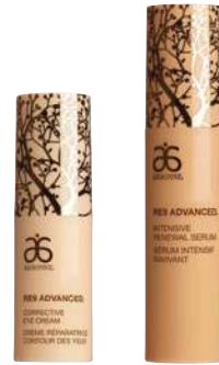
Image taken 30 days after use of the new RE9 Advanced Collection