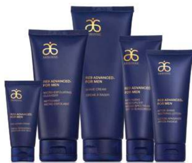
RE9 Advanced for Men